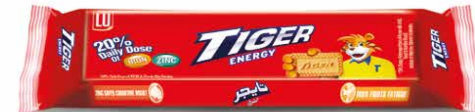
BAR PACK 48 x 18