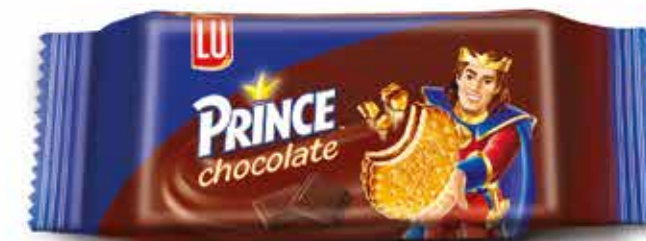
HALF ROLL 8 x 18