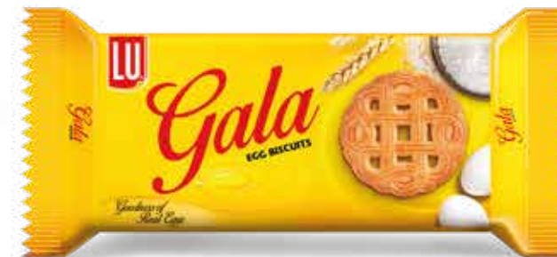
HALF ROLL 1 x 24