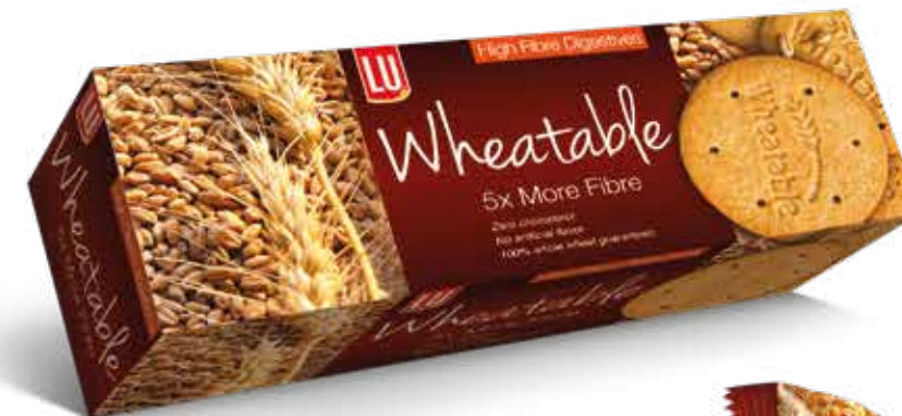
FAMILY PACK 1 x 24 / 1 x 48 / 1 x 96