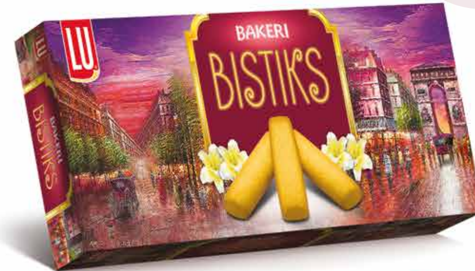
FAMILY PACK 1 X 24 / 1 X 48 / 1 X 96