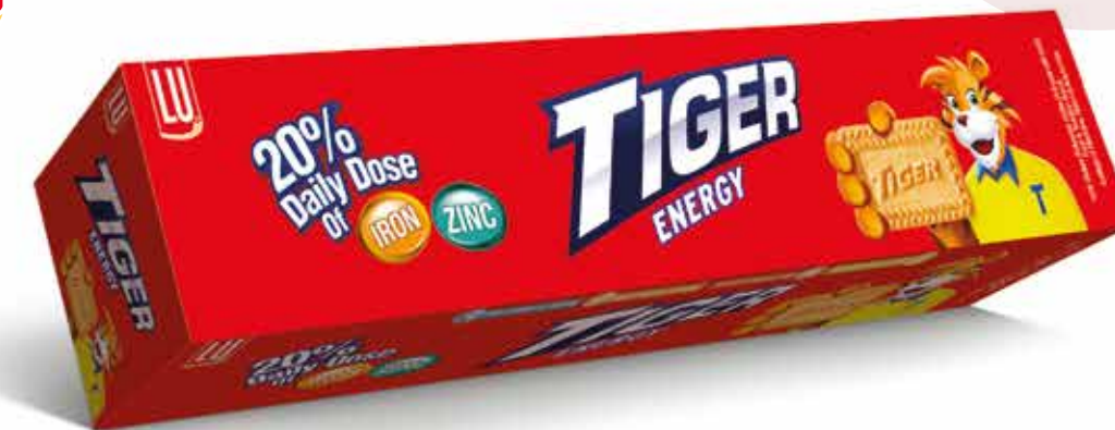
FAMILY PACK 1 x 24 / 1 x 48 / 1 x 96