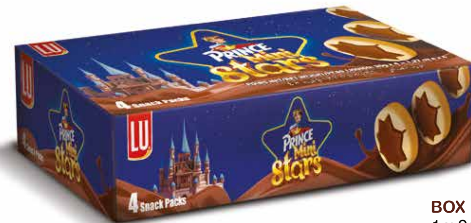
BOX 1 x 24