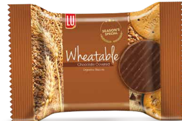
TICKY PACK 16 x 18