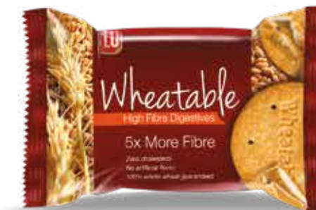
HALF ROLL 8 x 24