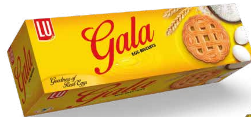
FAMILY PACK 1 x 24 / 1 x 48 / 1 x 96