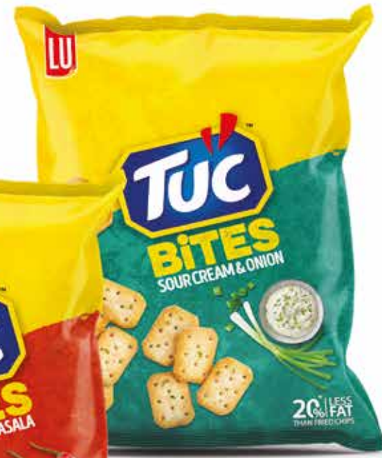
SNACK PACK 24 x 4