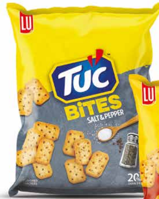
SNACK PACK 24 x 4