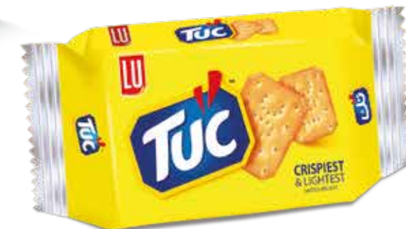
SNACK PACK 8 x 18