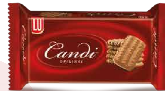
HALF ROLL 10 X 18