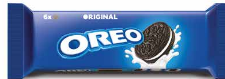
VALUE PACK 5 x 24