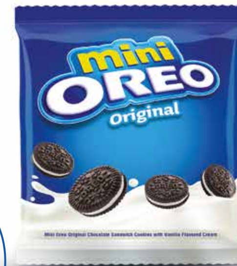
SNACK PACK 15 x 18