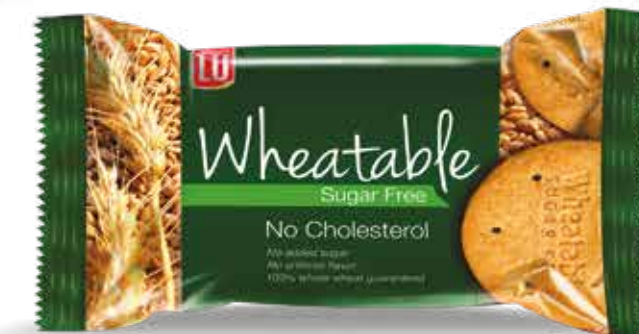
SNACK PACK 6 x 18