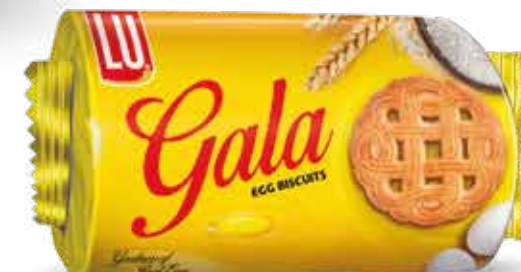
SNACK PACK 10 x 18