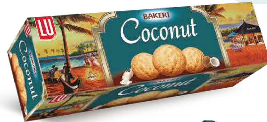
FAMILY PACK 1 X 24 / 1 X 48 / 1 X 96