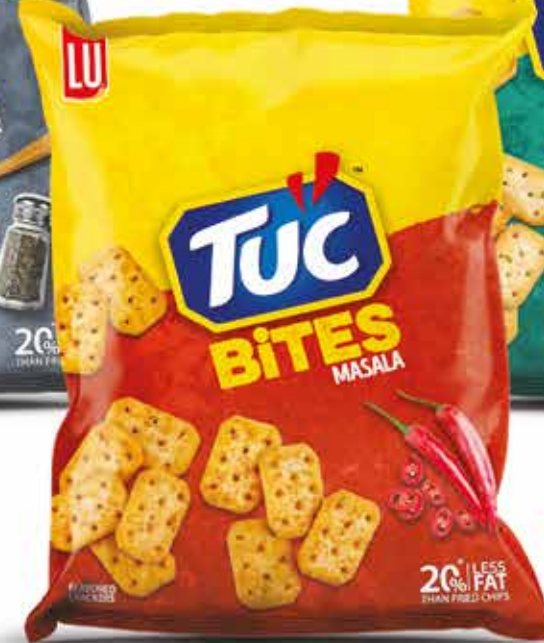
SNACK PACK 24 x 4