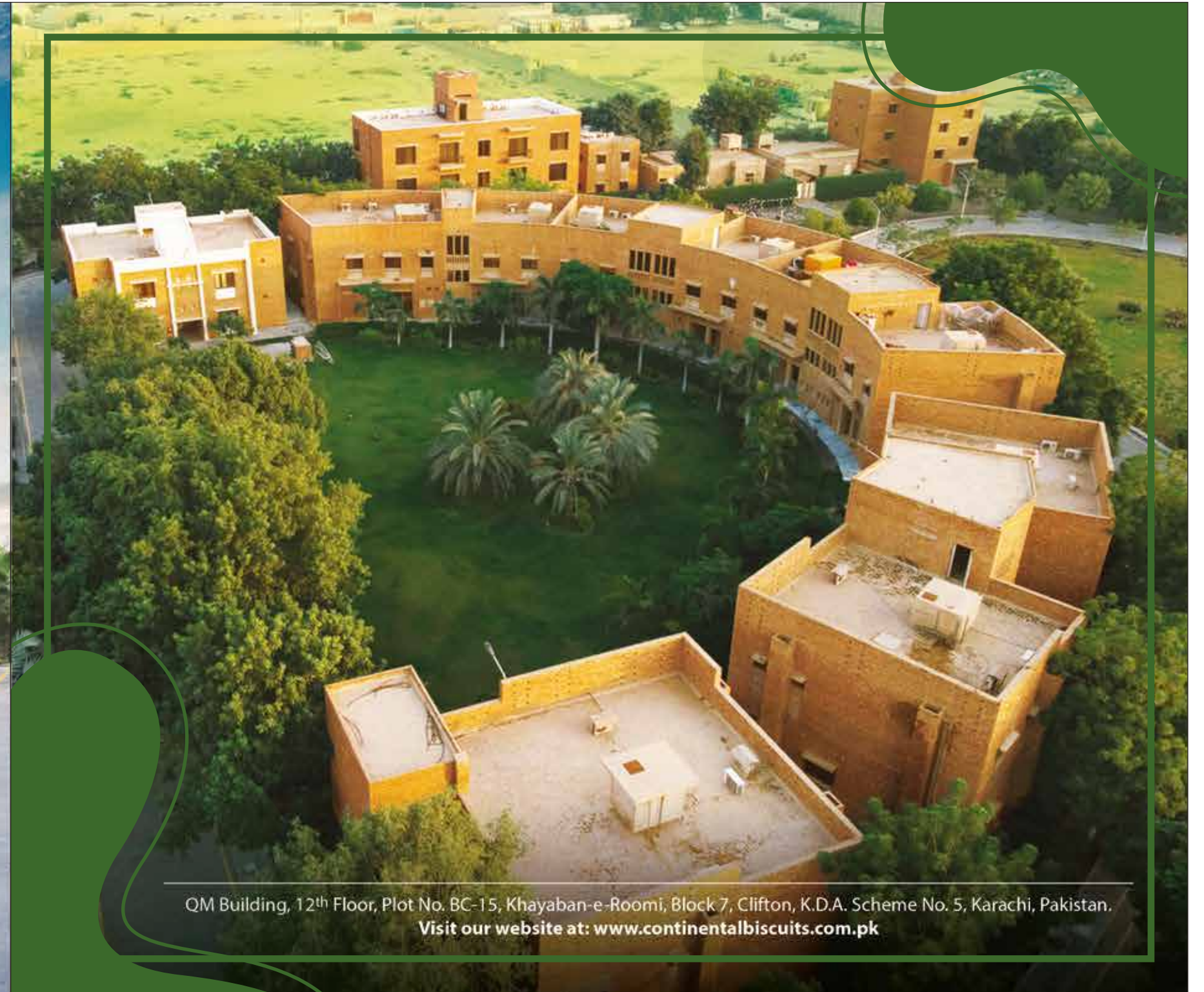
QM Building, 12 th Floor, Plot No. BC-15, Khayaban-e-Roomi, Block 7, Clifton, K.D.A. Scheme No. 5, Karachi, Pakistan. Visit our website at: www.continentalbiscuits.com.pk