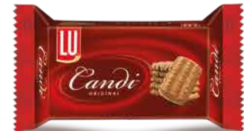
BAR PACK 15 X 18