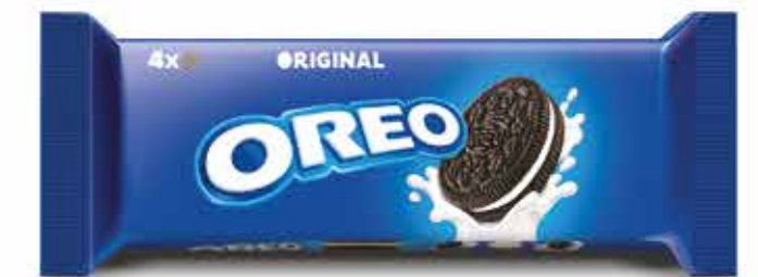
SNACK PACK 10 x 24