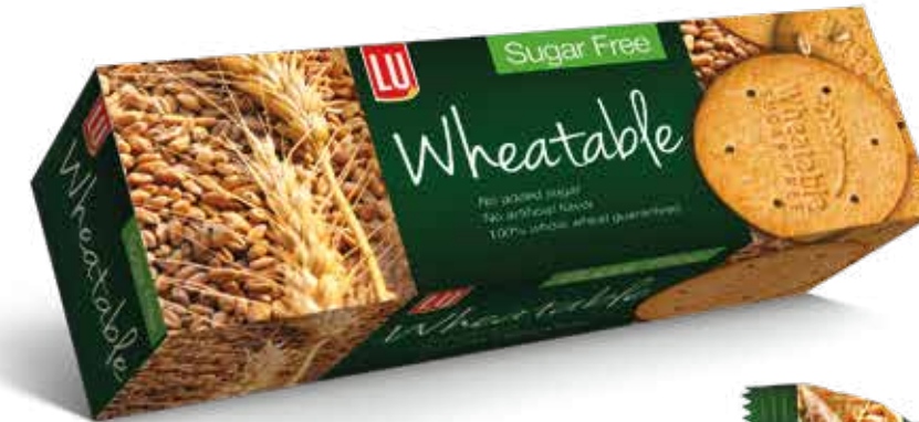
FAMILY PACK 1 x 24 / 1 x 48 / 1 x 96