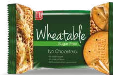
TICKY PACK 15 x 18