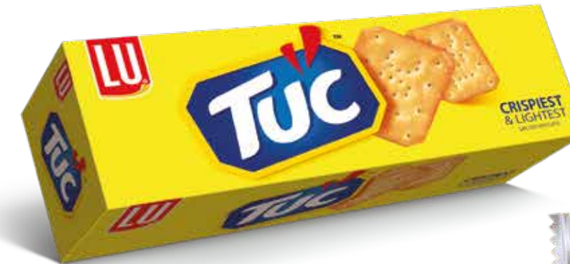
FAMILY PACK 1 x 24 / 1 x 48 / 1 x 96