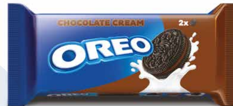
BAR PACK 16 x 18