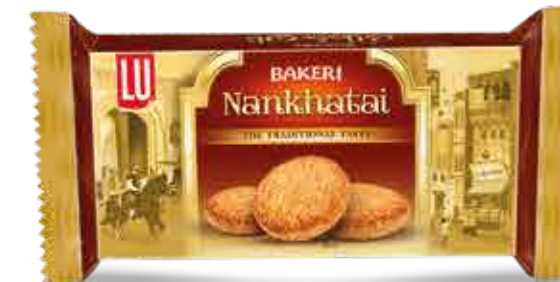
HALF ROLL 8 X 18