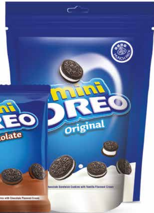
MUNCH PACK 1 x 18