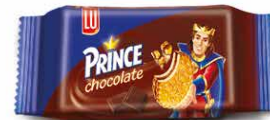
BAR PACK 16 x 18