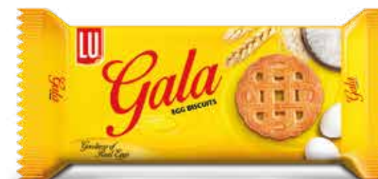
BAR PACK 12 x 30