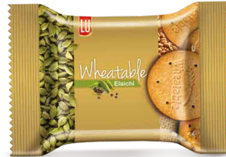
HALF ROLL 8 x 24