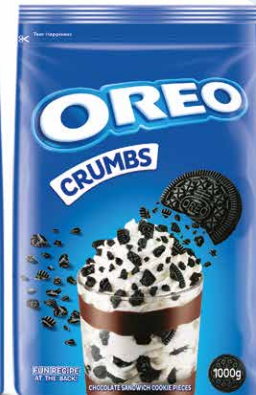
1000g POUCH 1 x 10