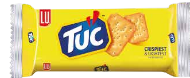
BAR PACK 15 x 18