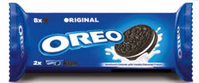
TUBE PACK 1 x 24