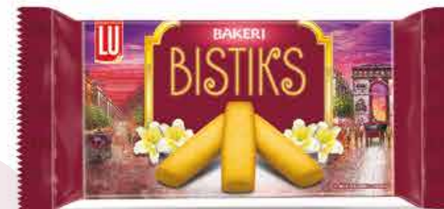
HALF ROLL 8 X 18