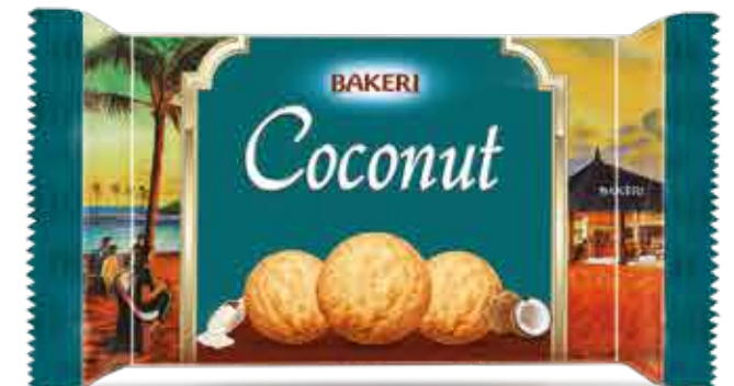
SNACK PACK 6 X 18