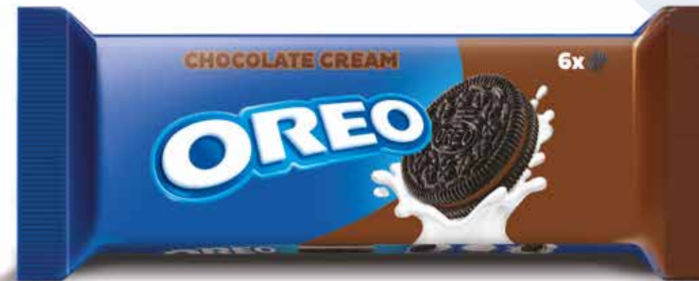
VALUE PACK 1 x 18