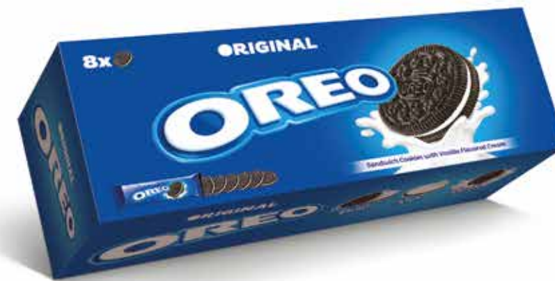
FAMILY PACK 1 x 24 / 1 x 48 / 1 x 96