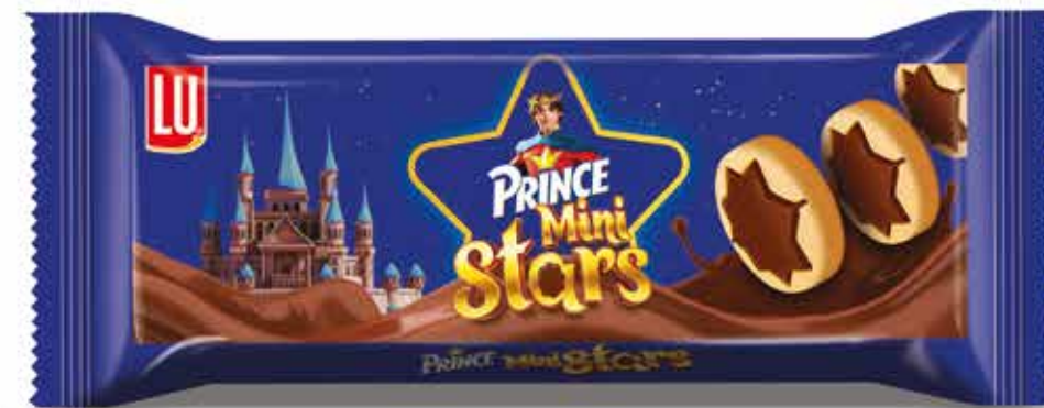
BAR PACK 12 x 18 / 1 x 24