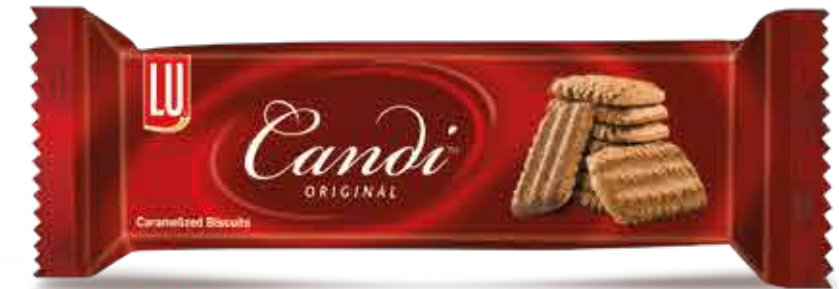
SNACK PACK 8 X 18