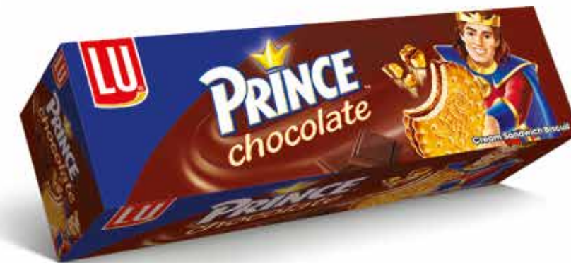
FAMILY PACK 1 x 24 / 1 x 48 / 1 x 96