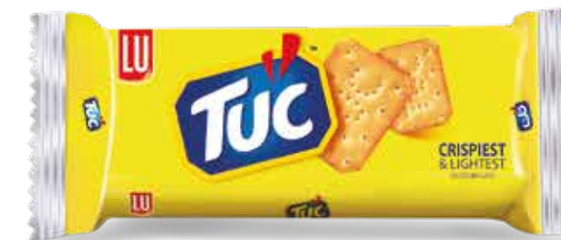
HALF ROLL 8 x 18