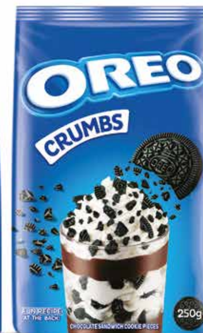
250g POUCH 12 x 6