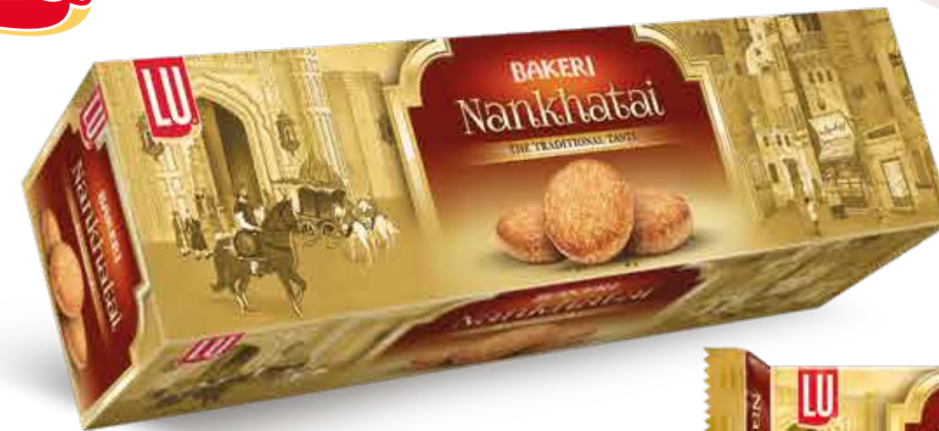
FAMILY PACK 1 X 24 / 1 X 48 / 1 X 96