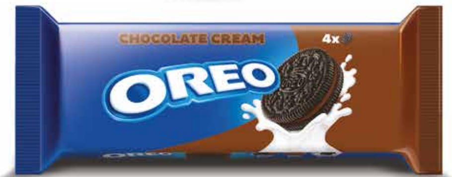
SNACK PACK 8 x 18