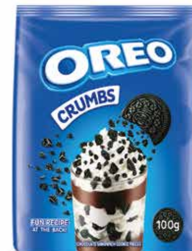
100g POUCH 1 x 24