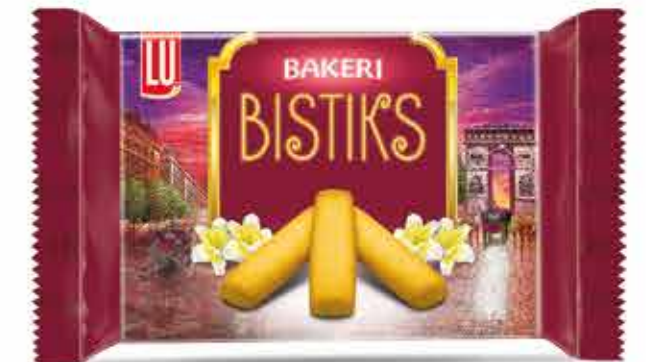
SNACK PACK 6 X 18