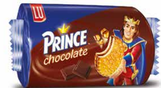
SNACK PACK 6 x 18