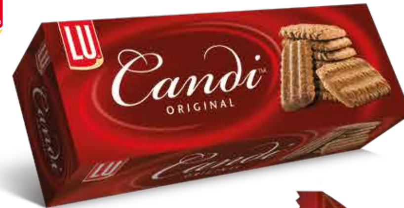
FAMILY PACK 1 X 24 / 1 X 48 / 1 X 96