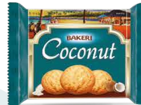
HALF ROLL 8 X 24