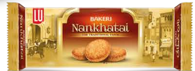
SNACK PACK 8 X 18