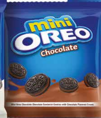
SNACK PACK 15 x 18