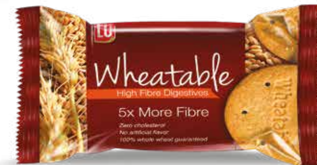
SNACK PACK 6 x 18