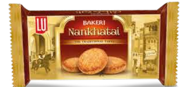
BAR PACK 15 X 18