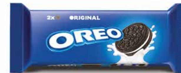
BAR PACK 20 x 24